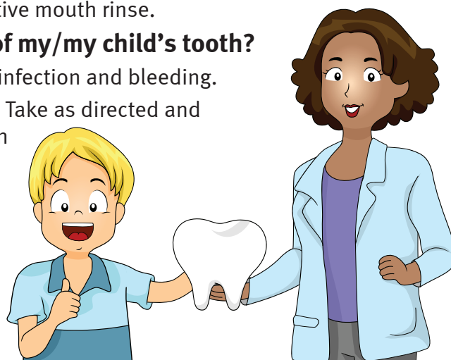
Image 2: Dental practitioner and smiling boy holding an extra large tooth