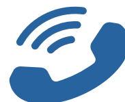
Image 5: Ringing phone symbol