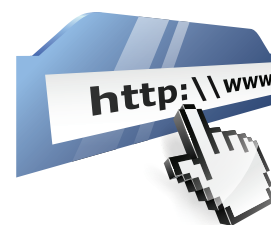
Image 4: Website address symbol

www.qld.gov.au/health/staying-healthy/atods/smoking/index.html